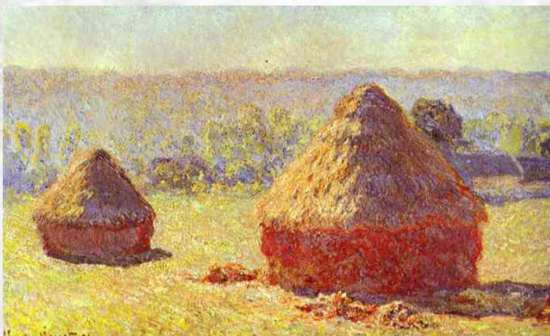
Haystack, End of Summer, 1891

Monet was passionate about Plein Air painting. This allowed him to see how light, the seasons, and the weather affected his subject or the object he was painting.