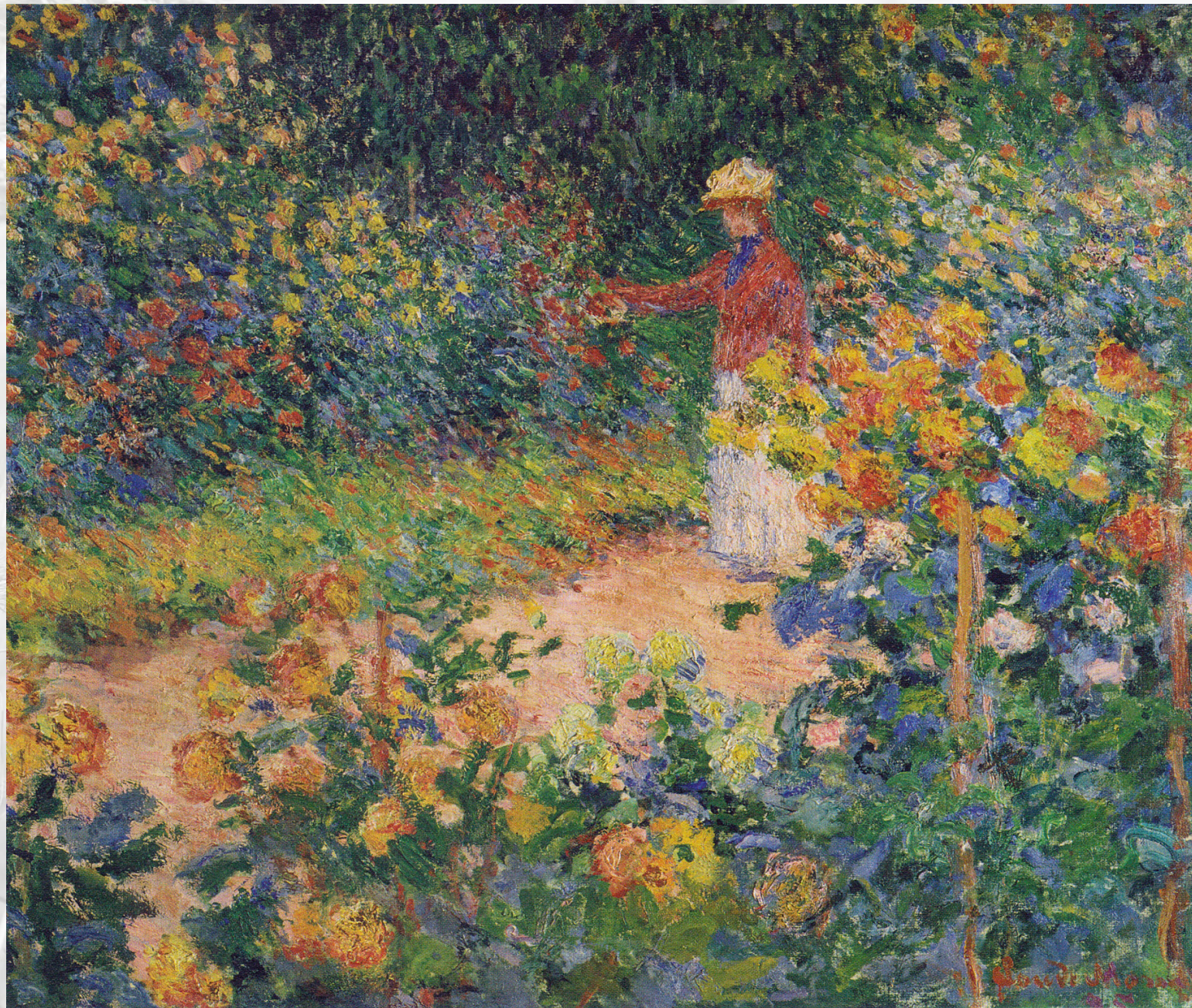
Monet's Garden at Giverny, 1895

Claude Monet once said, "I perhaps owe becoming a painter to flowers." Monet found a lot of his subjects from his garden in Giverny, France.