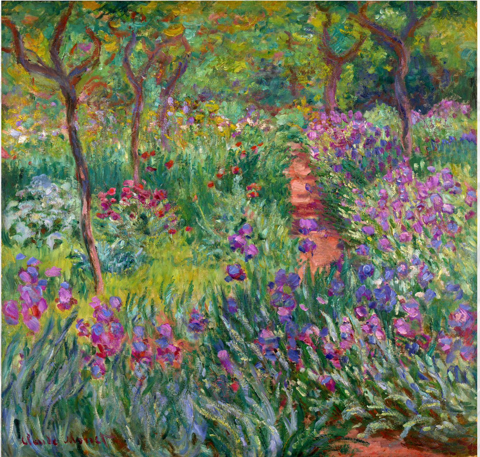
The Iris Garden at Giverny, 1900

Claude Monet once said, "I perhaps owe becoming a painter to flowers." Monet found a lot of his subjects from his garden in Giverny, France.