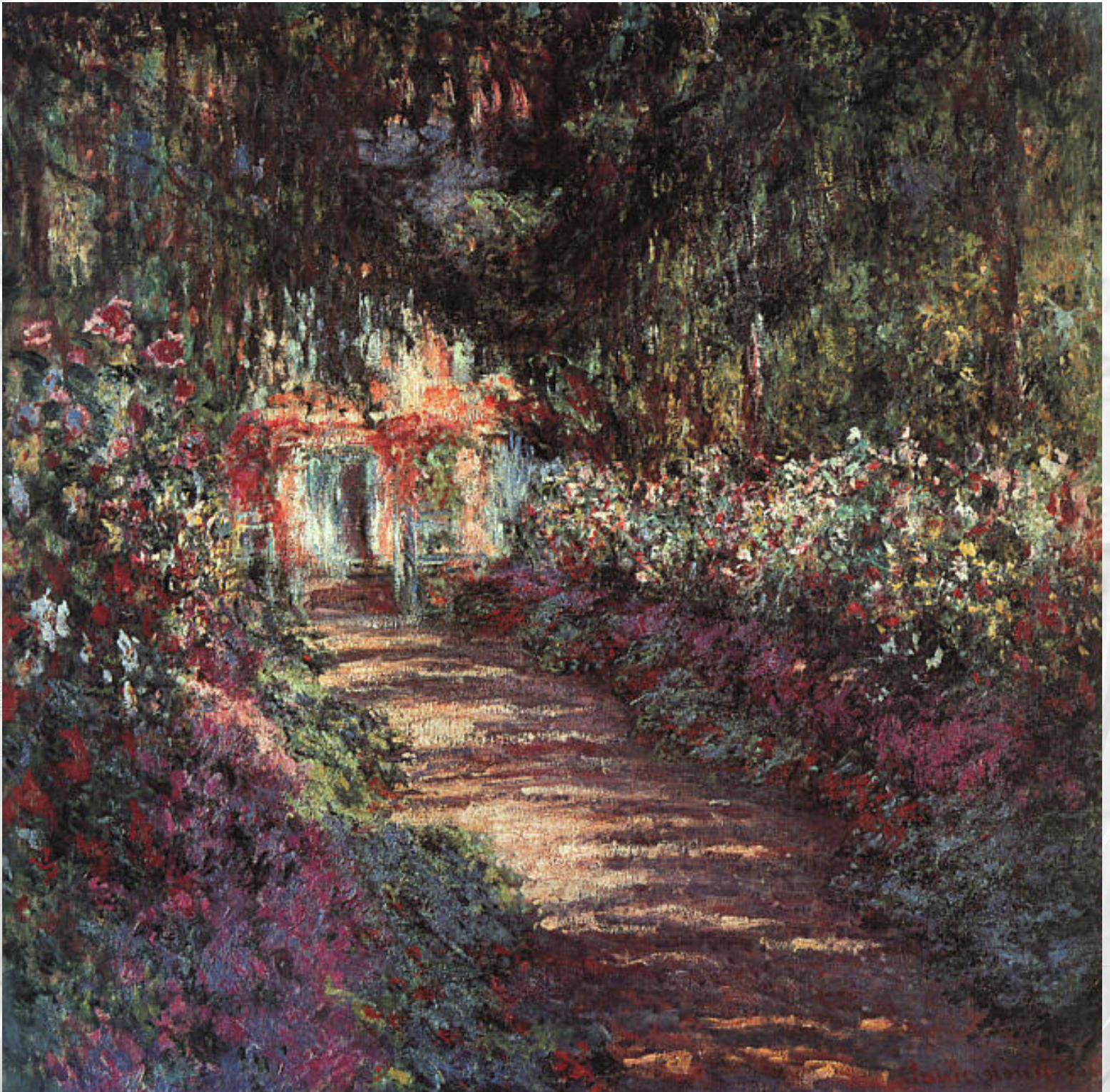
The Garden in Flower, 1900