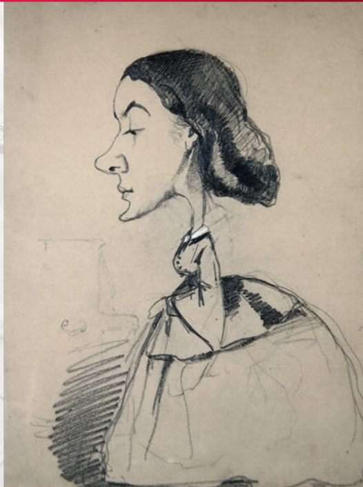
Young Woman at the Piano Claude Monet, 1855-1869