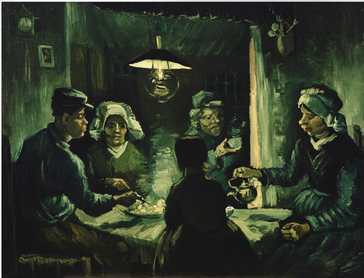
The Potato Eaters, 1885

In the small community of Nuenen (in the Netherlands), the hardworking peasants both grew and ate potatoes. With the help of someone in your family, make a dish of Baby Dutch Potatoes. Click on the picture to get the recipe.