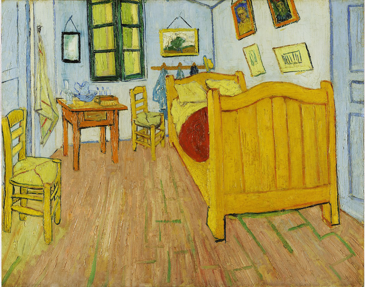
Bedroom in Arles, 1888

Use the following format to create a descriptive poem about your bedroom. This five-line poem is called a cinquain .