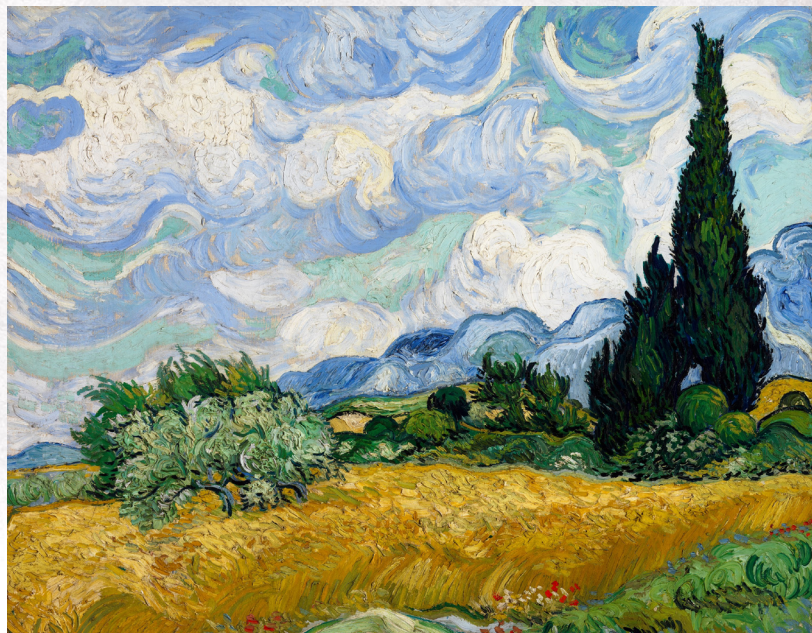
Wheat Field with Cypresses painting, 1889